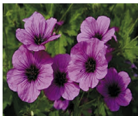
Figure 3. Pelargonium graveolens L' Herit.