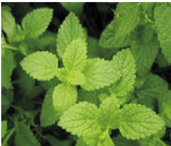
Figure 6. M. piperita Linn.

primary constituent of peppermint oil. At least 44% free menthol is present in peppermint oil. Components are sensitive to climate, latitude and maturity of the plant. Inhalation and application of menthol on skin causes a skin reaction. It is used in many liniments dosage form to relieve pain spasms and arthritic problems. Peppermint oil is studied and documented for its antiinflammatory, analgesic, anti-infectious, antimicrobial, antiseptic, antispasmodic, astringent, digestive, carminative, fungicidal effects, nerve stimulant, vasoconstrictor, decongestant and stomachic properties.