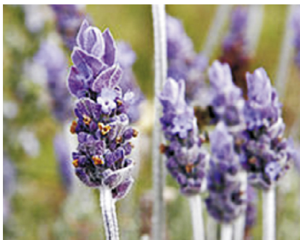
Figure 4. Lavandula officinalis Chaix.

Peppermint [ Mentha piperita Linn. ( M. piperita )] belongs to the family of Lamiaceae (Figure 6). Till date, all the 600 kinds of mints are raised from 25 well-defined species. The two most important are peppermint ( M. piperita ) and spearmint ( Mentha spicata ). Spearmint bears the strong aroma of sweet character with a sharp menthol undertone. Its oil constituents include carvacrol, menthol, carvone, methyl acetate, limonene and menthone. The pharmacological action is due to menthol, a