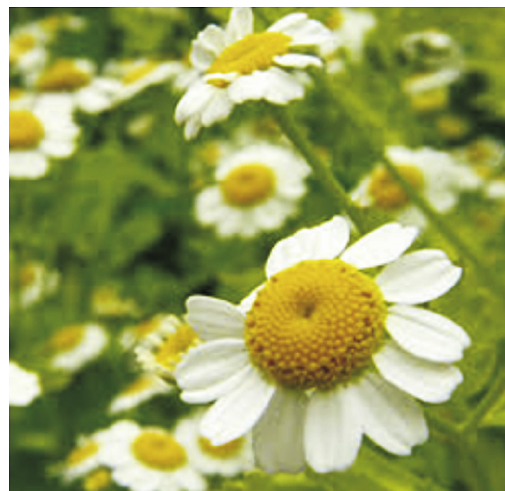
Figure 7. Anthemis nobilis Linn.

Its antianxiety, stress relieving properties ease out depression, worry, and overactive mind. Its use before sleep for bath can relax both mind and body and brings on sleep, with a peaceful