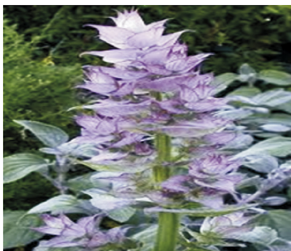
Figure 1. Salvia sclarea Linn.

Geranium ( Pelargonium graveolens L' Herit) belongs to the family of Geraniaceae (Figure 3). A perennial hairy shrub native