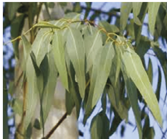
Figure 2. E. globulus Labill.

Eucalyptus [ Eucalyptus globulus Labill ( E. globulus )] belonging to the family of Myrtaceae, is a long evergreen plant with a height up to 250 feet (Figure 2). It is known for its