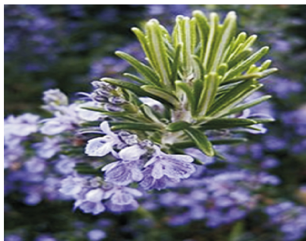
Figure 8. Rosmarinus officinalis Linn.

Rosemary ( Rosmarinus officinalis Linn.) belonging to the family of Lamiaceae bears small pale blue flowers in late spring/early summer and grows up to the height of 90 cm (Figure 8). It has three varieties (silver, gold and green stripe); it's the green variety that is used for its medicinal properties. This plant is rich in bitter principle, resin, tannic acid and volatile oil. The active constituents are bornyl acetate, borneol along with other esters and, special camphor similar to that possessed by the myrtle, cineol, pinene and camphene [40]. Its oil has a marked action on the digestive system, with relieving the symptoms of indigestion, constipation and colitis. It works as liver and gall-bladder tonic. The oil also possesses some good action on the cardiovascular system. It regularizes the blood pressure and retards the hardening of arteries. In winter, it used to relieve the