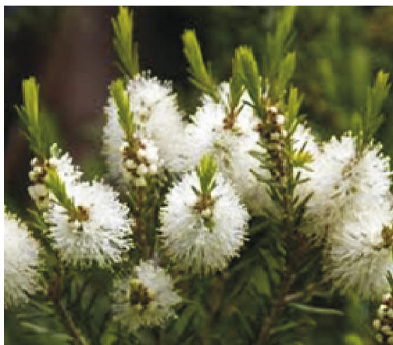
Figure 9. Melaleuca alternifolia Cheel.

Ylang-ylang ( Cananga odorata Hook. F. & Thoms) belonging to the family of Annonaceae, native to Madagascar, Indonesia and Philippines is a small tree (Figure 10). Its chemical constituent includes geranyl acetate, linalol, geraniol,