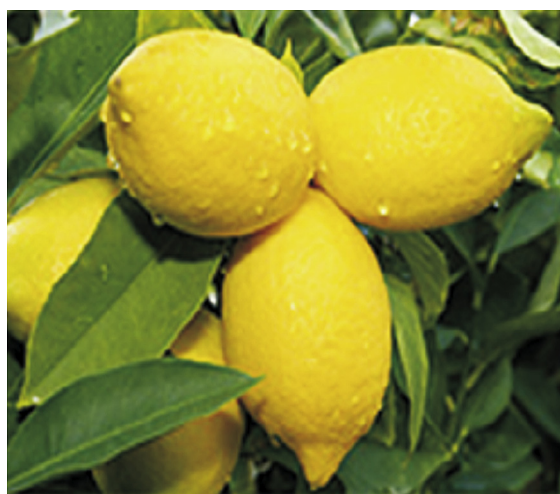
Figure 5. C. limon Linn.